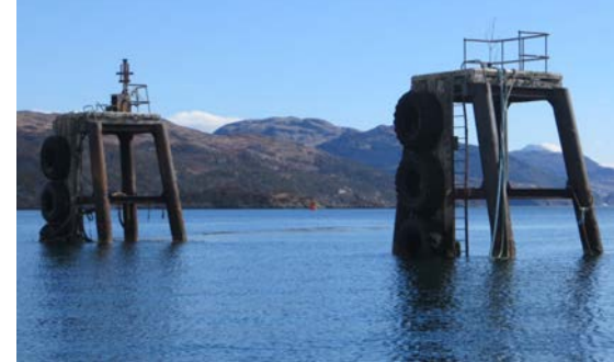
Harbour dolphins —CMAL (2020)