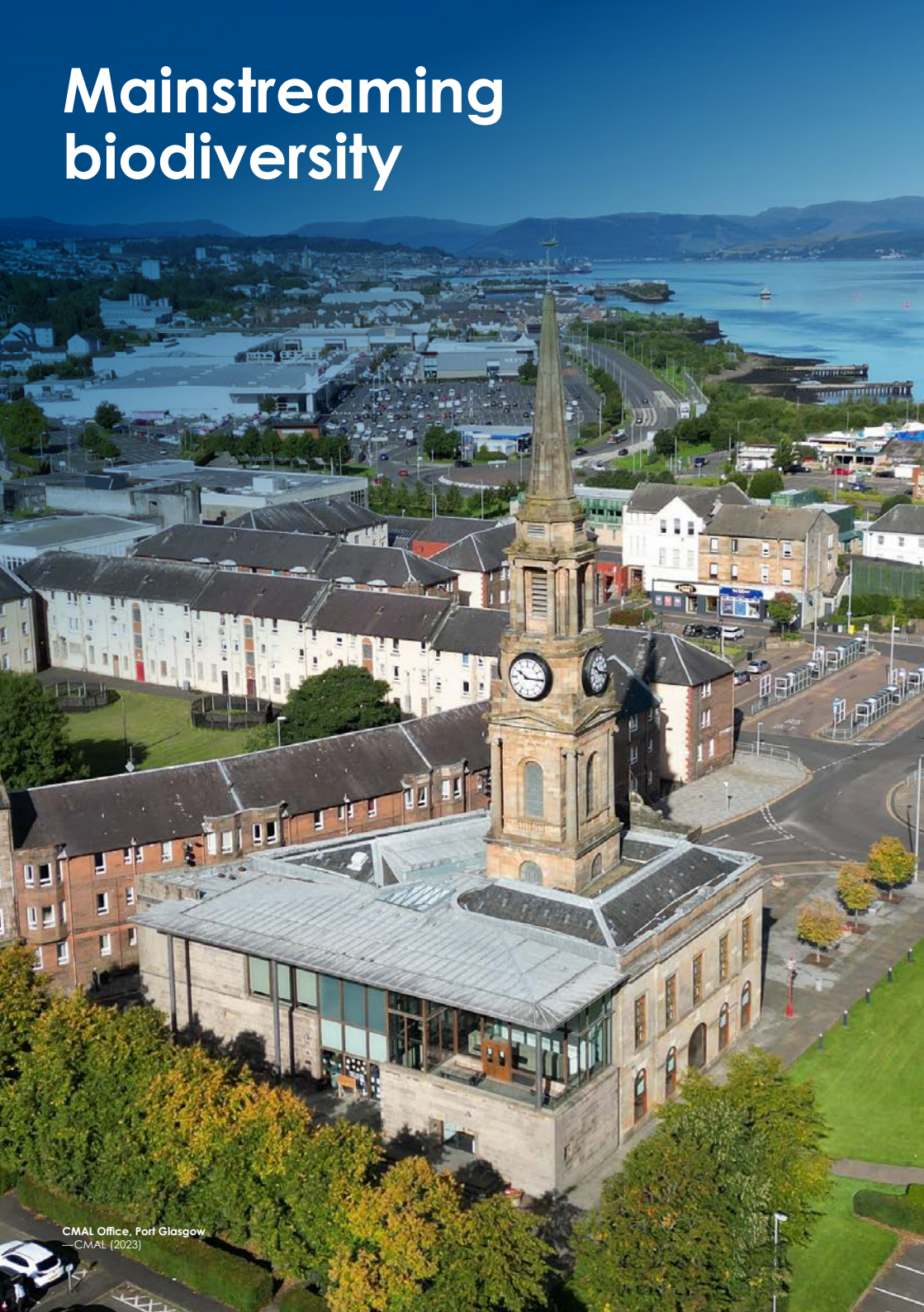
CMAL Office, Port Glasgow —CMAL (2023)