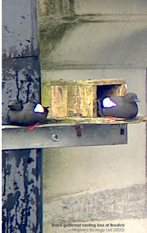
Black guillemot nesting box at Brodick

An Ecological Clerk of Works (ECOW) provided oversight of all demolition works to ensure that the protected species and other wildlife were not impacted and to halt works if required.