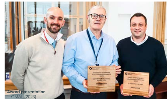
Award presentation —CMAL (2023)

Based on the results of Environmental Impact Assessment Scoping Reports and Environmental Impact Assessments prepared for our projects, we routinely explore opportunities to enhance biodiversity.