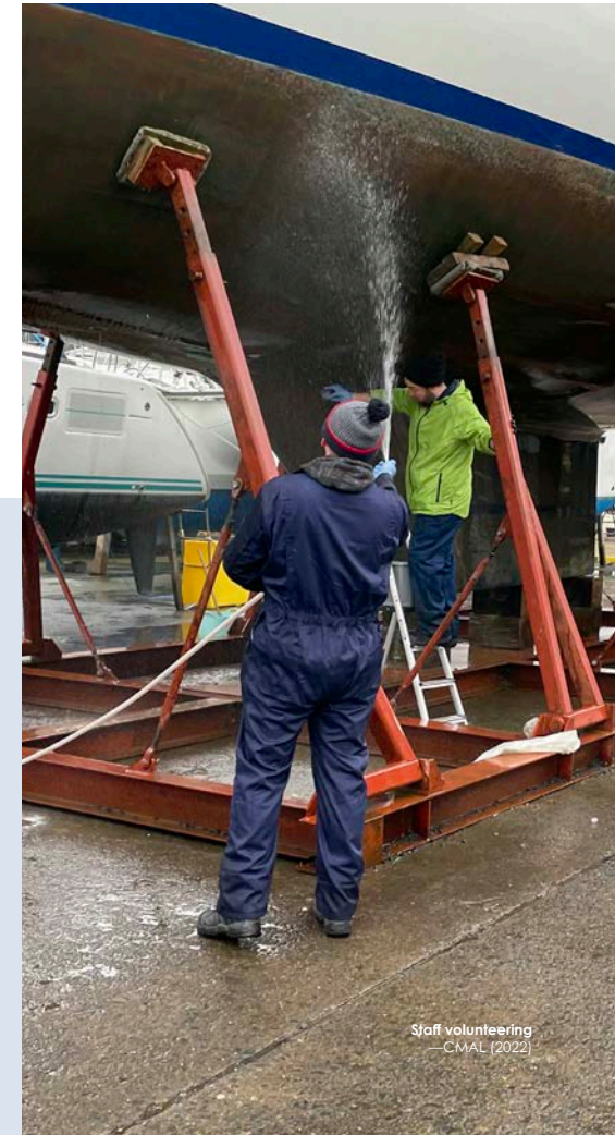
Staff volunteering —CMAL (2022)

The voyages provide personal and social development while raising environmental awareness of the marine environment.